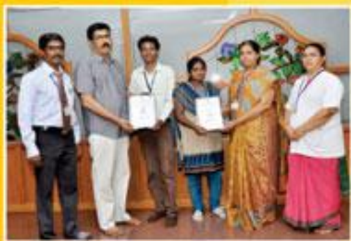
ISTE Chapter Award