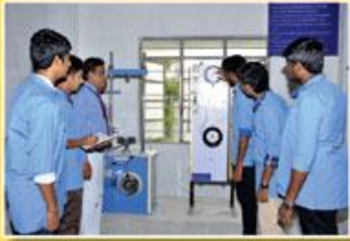
Material Testing Centre