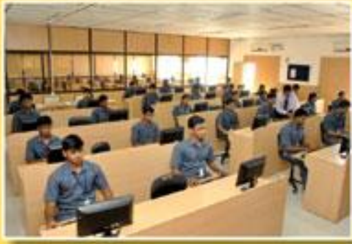
EMC 3 Big Data Analytics Centre