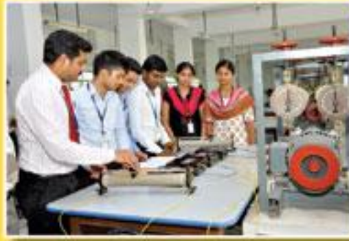
Centre of Excellence for Electrical Machines