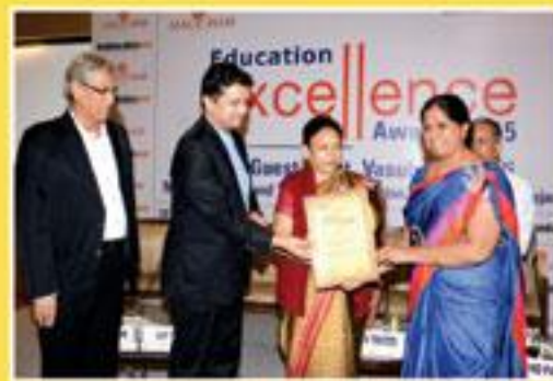
Education Excellence Award