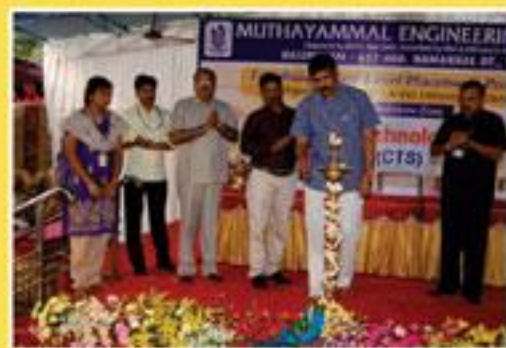
State Level Placement Programme