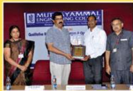
Seminar on Qualitative Research