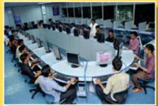
Network Simulation Centre