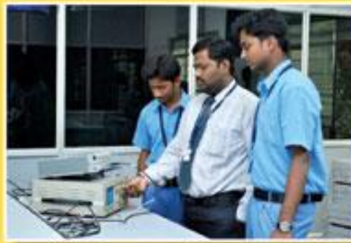
Centre of Excellence for VLSI Design