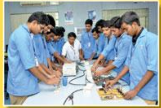
Wipro Mission 10X Centre