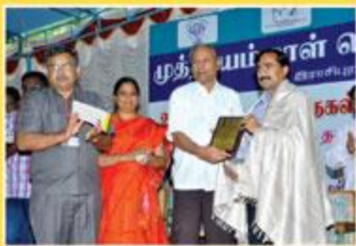
National Children State Congress